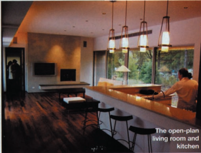
The open-plan living room and kitchen