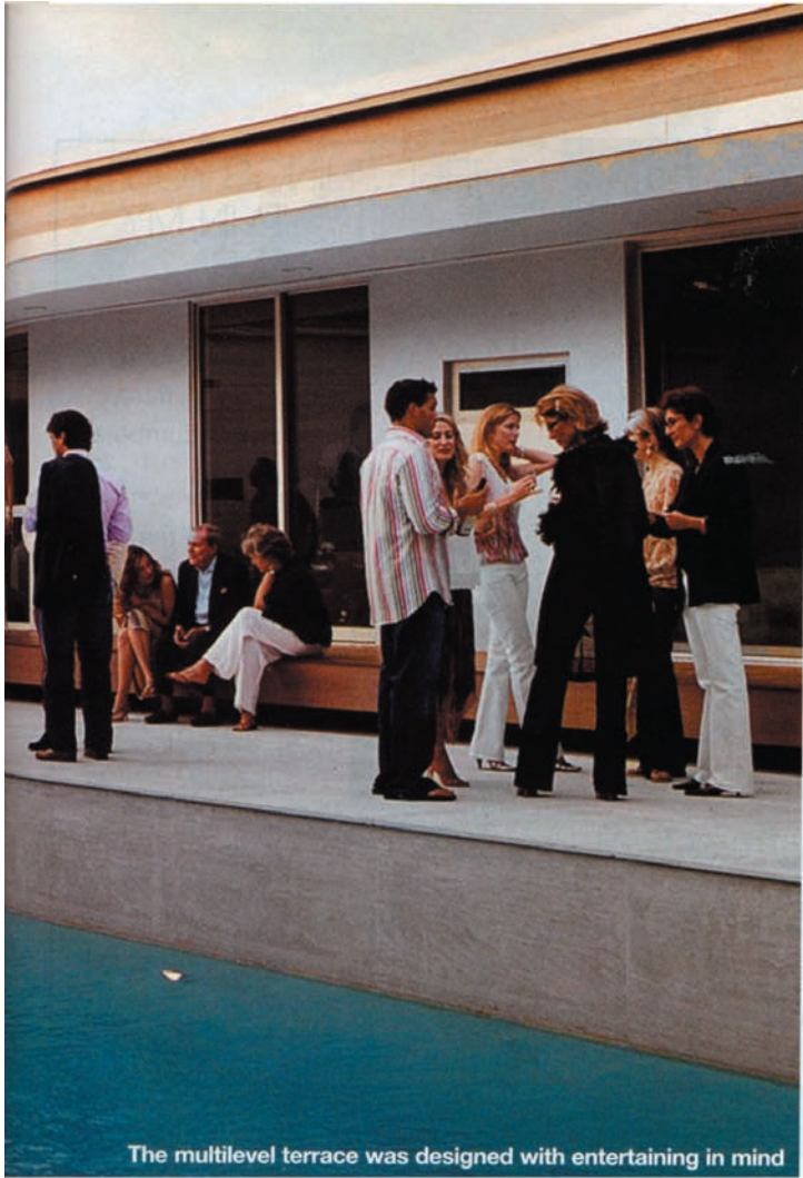
The multilevel terrace was designed with entertaining in mind