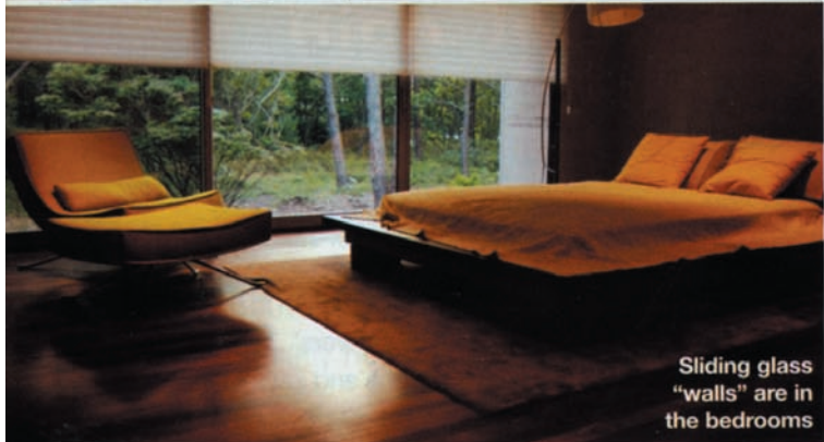
Sliding glass "walls" are in the bedrooms

Who would have thought that the architects behind such famous buildings as the Getty Center in Los Angeles and the Central Terminal Complex at JFK Airport would be designing homes that you could buy?